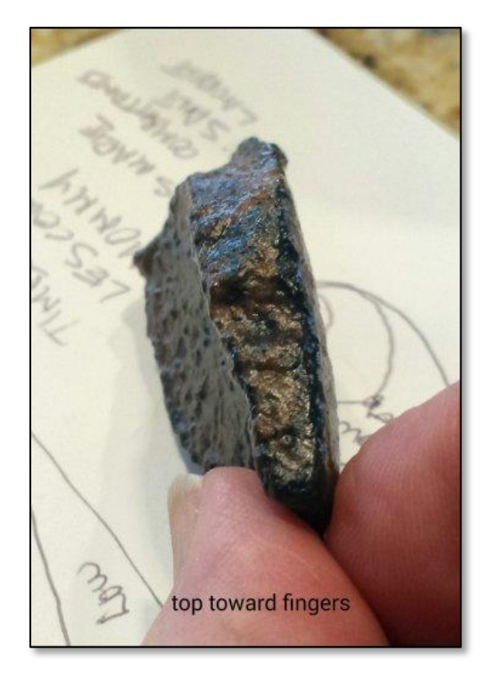
Detail of second fragment showing thickness thinning and ogive of fragment. Fuse end of shell (ogive end) is toward fingers.

The lower fragment is also interesting. It also has an ogive on the right side and careful observation of the upper portion of the fragment indicates the presence of a flame groove . This should point to a Hotchkiss case-shot projectile. Any estimate of the caliber of this projectile would have to make use of its non-ogive end of the fragment.